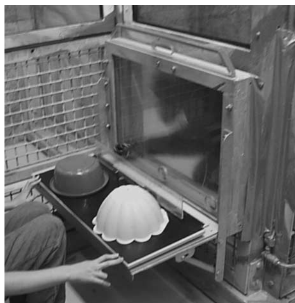
Figure 1. Apparatus. Chimpanzees and bonobos chose between fixed and risky rewards hidden under bowls.

In choices between a fixed and a risky reward option (using choice trials from all sessions), chimpanzees were risk seeking (mean \pm s.e. proportion choosing fixed option, 0.36 \pm 0.04 ), significantly preferring the risky reward ( t(4) = -3.48 , p = 0.025 one sample t -test, all reported comparisons are two-tailed). In contrast, bonobos were risk averse ( 0.72 \pm 0.03 ), preferring the fixed reward to the risky ( t(4) = 6.40 , p = 0.003 ).